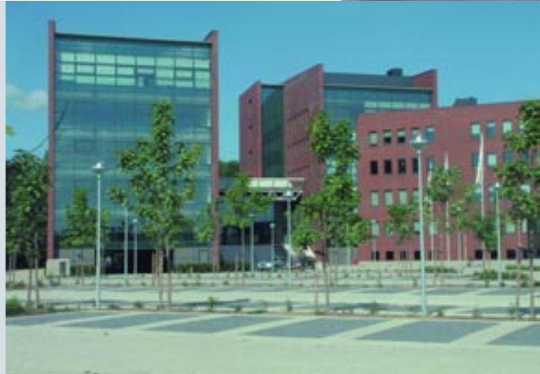
High Tech Park