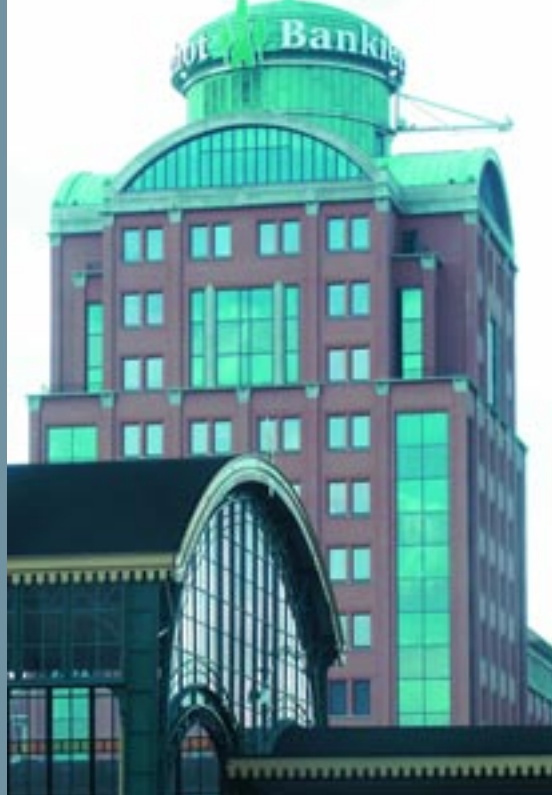
蘭斯賀銀行大樓 / Building Van Lanschot Bank

本市組織和舉辦了眾多豐富多彩的文化活動和享有盛譽的體育大賽。整個城市充滿著生機和活力，從就業率的增長和拔地而起的高樓大廈就可見一斑。在50公里的範圍內就有5所大學。斯赫托根波希市擁有許多風景優美的住宅區。新開發的大輪和哈富來住宅區又錦上添花，該區別具特色，環繞在森林和大自然之中。