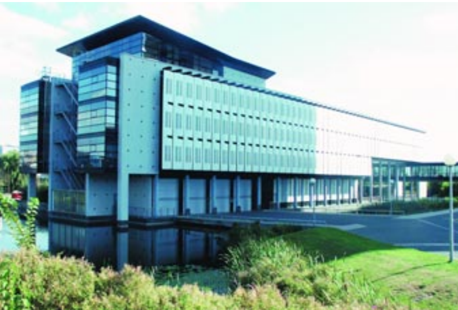
培特拉工業園中的省政府大廈

Of course, we wish to realize opportunities and make use of favourable qualities. City authorities conduct an active development and stimulation policy that offers space and opportunities to both existing and new companies. You may expect from the city authorities, and in particular, our account managers, that they will guarantee a customer-oriented and entrepreneur-friendly attitude.