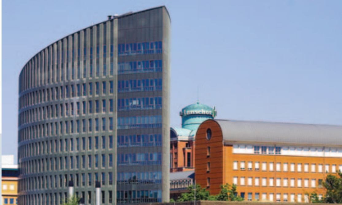
帕萊司小區 Palace Quarter