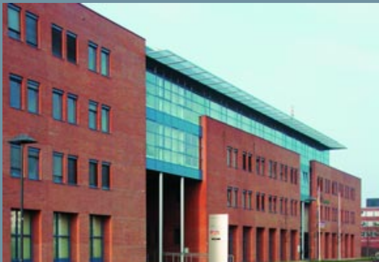
農業大學 / University of Applied Agriculture